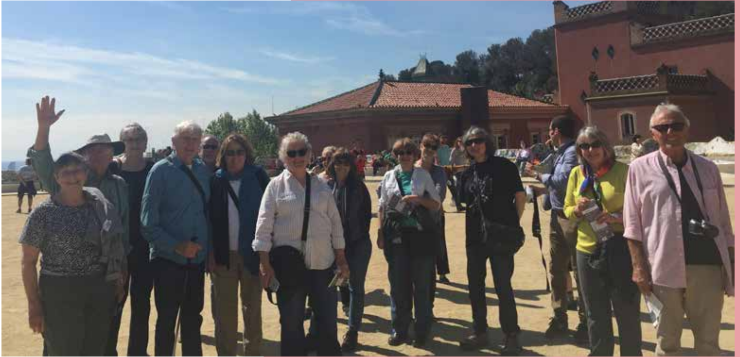
Potters Council members in Barcelona, Spain, April 2016

Potters Council members are the driving force behind all decisions and actions that take place every day. This is why Potters Council offers you the ability to: