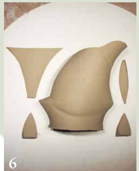
1. The oval-shaped cylinder with the first dart removed on its spout side. 2. The cut and removed section of the pitcher's handle side. 3. The pitcher's profile after four darts have been removed. 4. Add a spout to the rim, then shape it to fit the form. 5. Add a pulled handle to an angled section of the body. 6. The deconstructed pitcher: the removed darts and the final form.