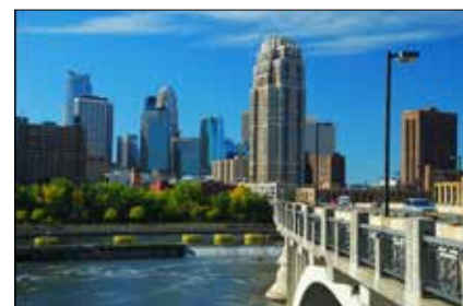
MINNEAPOLIS, MINNESOTA MARCH 27-30, 2019

Reach thousands of conference attendees as they plan their visits to workshops, technical sessions and your booth during this intensive 4-day event.