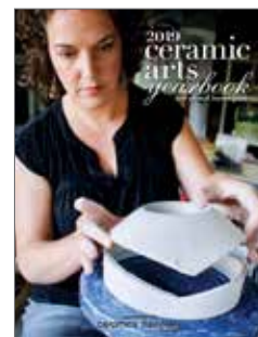
ANNUAL YEARBOOK AND BUYERS GUIDE

This comprehensive guide and studio reference is the first place readers of both Ceramics Monthly and Pottery Making Illustrated turn to for researching equipment and supplies before placing orders. They'll also keep it on hand as a reference throughout the year.