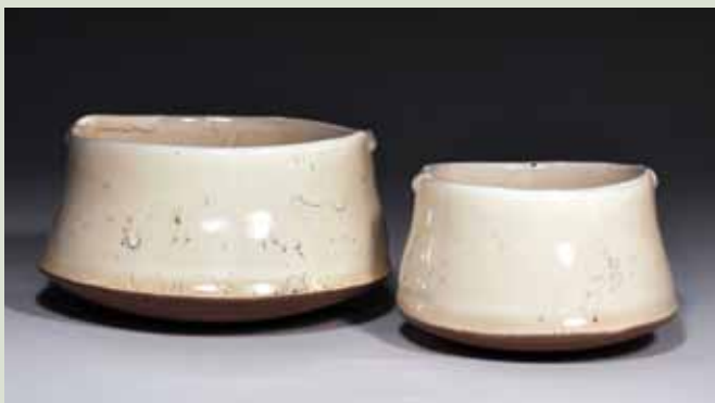
Belly bottomed bowls, up to 4½ in. (12 cm) in diameter, mid-range red clay, bisque slip, glaze, fired to cone 6.

Ceramic artist and educator currently living in northern New Mexico. One of my abiding philosophies is that the surface is just as important as the form. That being said, I tend to keep my forms minimal to avoid a visual contest with the glaze surface.