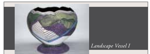
Landscape Vessel I